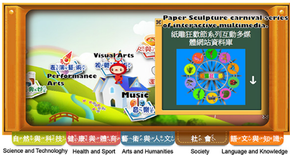
Figure 6. Graphical interface of children digital library showing a pop-up window