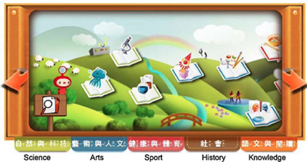
Figure 4. NLPI icon-only interface for children's digital library