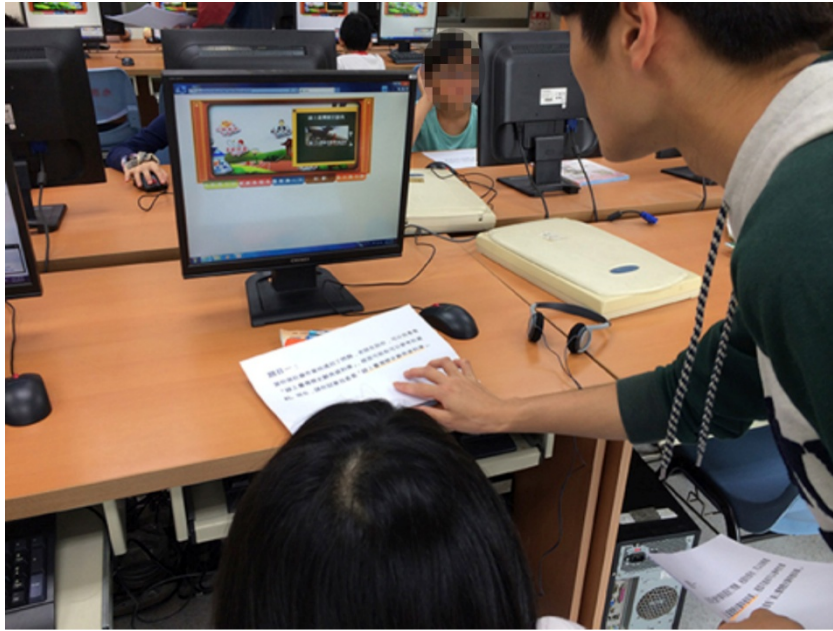
Figure 7. Children operating the graphical interface during the experiment