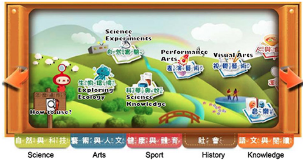
Figure 2. NLPI graphical interface for children's digital library