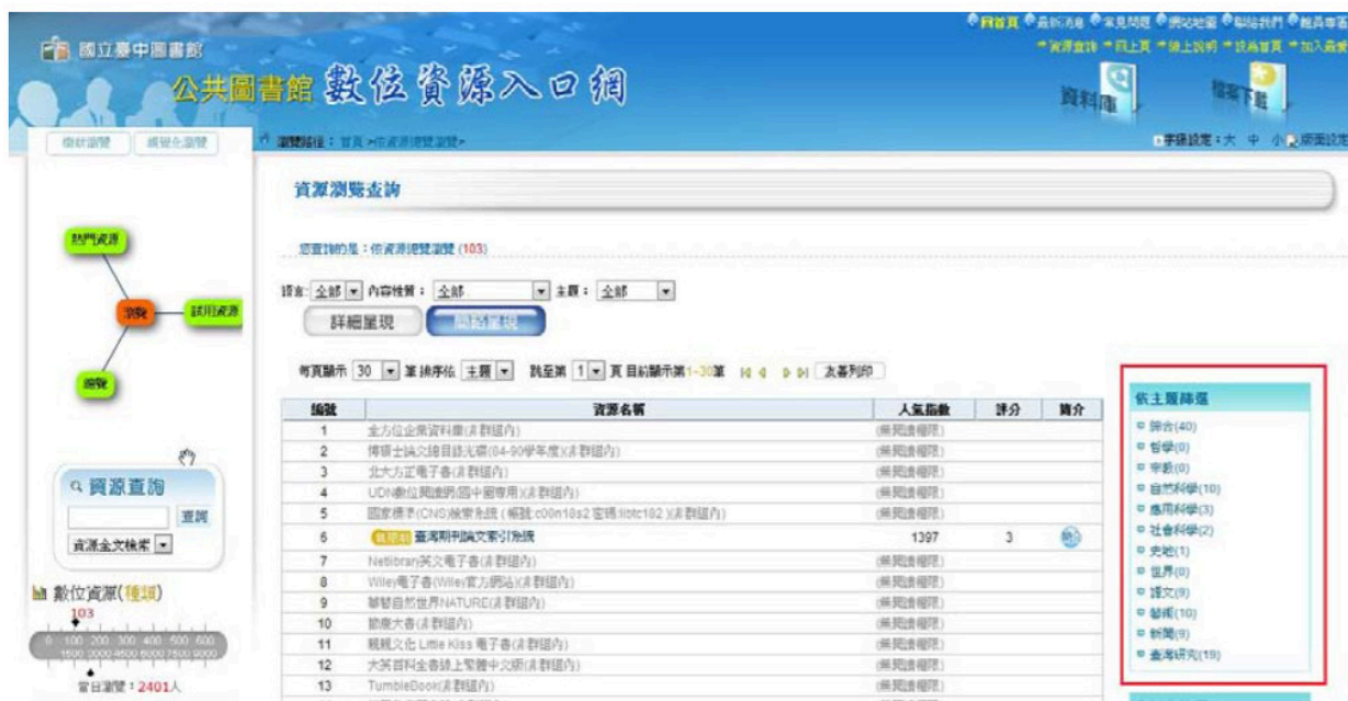
Figure 1. NLPI text-based interface

To deal with problems facing children in the use of this interface, Wu et al. [9] re-divided the NLPI database into five major categories: Natural Sciences, Fine Arts and Music, Health and Athletics, History and Culture, and Treasure of Knowledge. Wu et al.[9] produced an extensive two-dimensional virtual space interface based on pathfinding concepts, which prevents users from getting lost when searching for information through the inclusion of multi-level hyperlinks. The design of the interface used linked various icons to the various NLPI databases. This resulted in a graphical interface that was truly suitable for children (Fig. 2). They found that that when elementary school students used the new interface, their success rates and efficiency were significantly higher than those obtained from the original NLPI interface. In addition, the new graphical interface better complemented the information seeking behavior of children. We adopted this new graphical interface as the instrument in our experiment looking at gender differences in information seeking behavior.