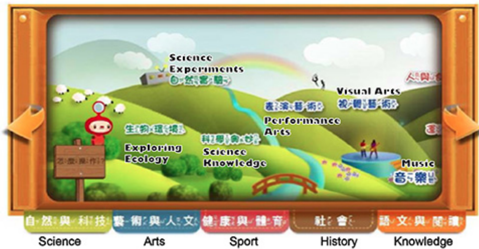
Figure 3. NLPI text-only interface for children's digital library